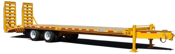
Shown with optional Elec/Hyd. ramps, 140K twin 2-speed jacks and paint.